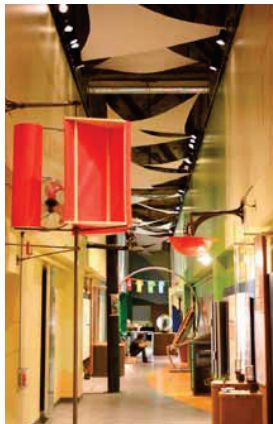
Arizona Science Center's Solarville